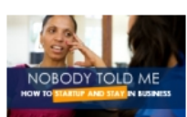
How to Startup and Stay in Business (video)