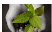
(audio) SistaSense Money Mindset System